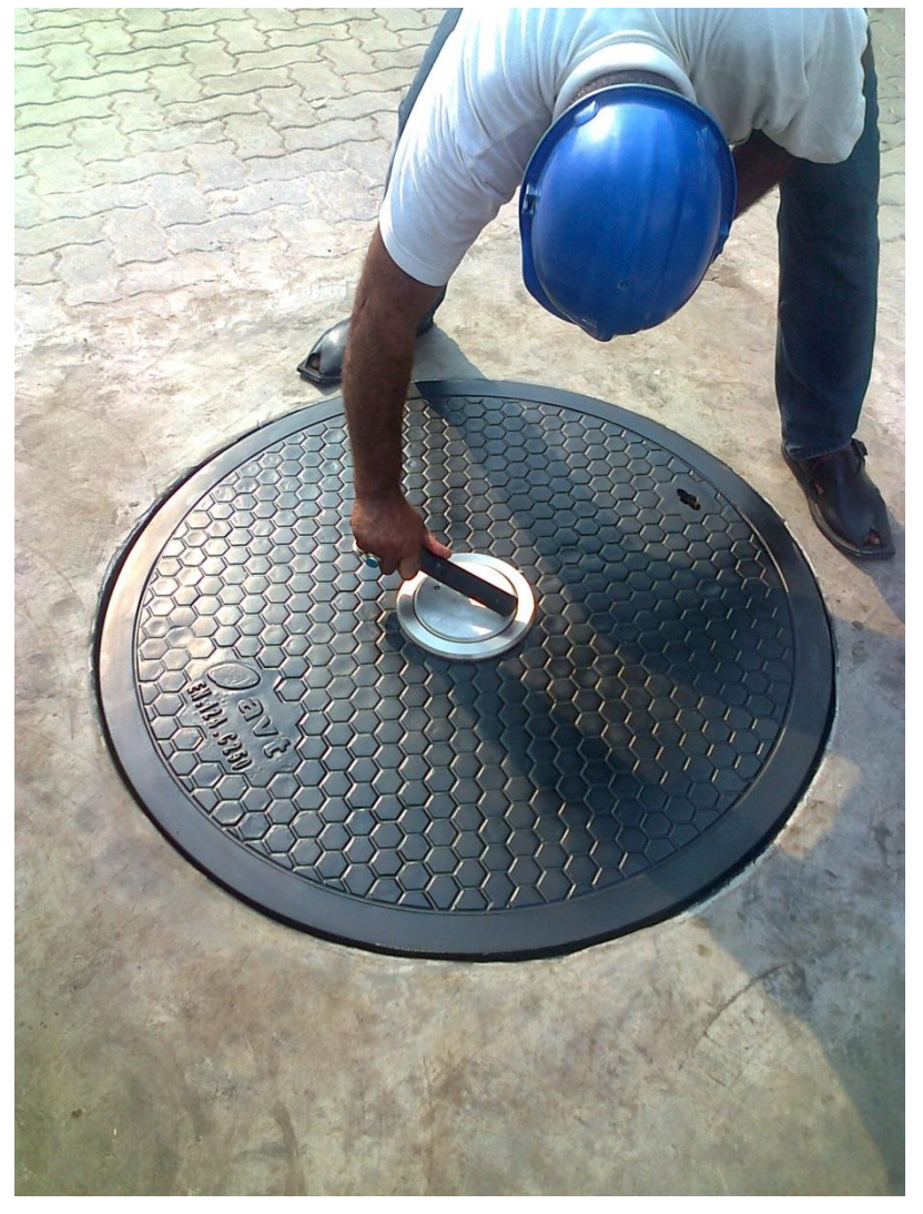
900 mm Dia